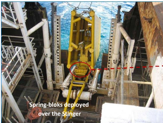
Spring-bloks deployed over the Stinger