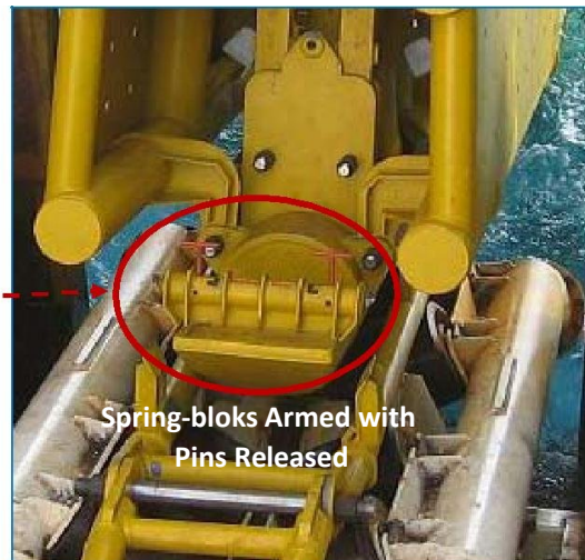
Spring-bloks Armed with Pins Released

Contact us about our full range of sub-sea connectors: